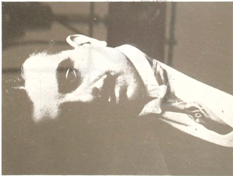
A portrait of the young Aga Khan III.