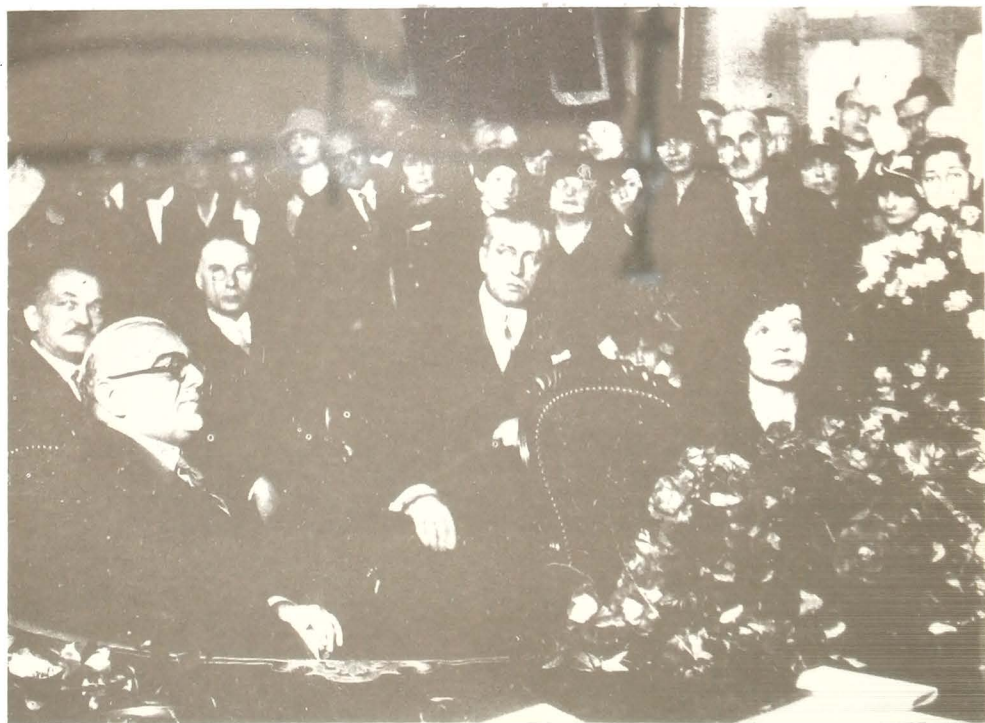
Aga Khan III and his third wife, Mlle Carron (Begum Andrée), at their wedding in 1929.