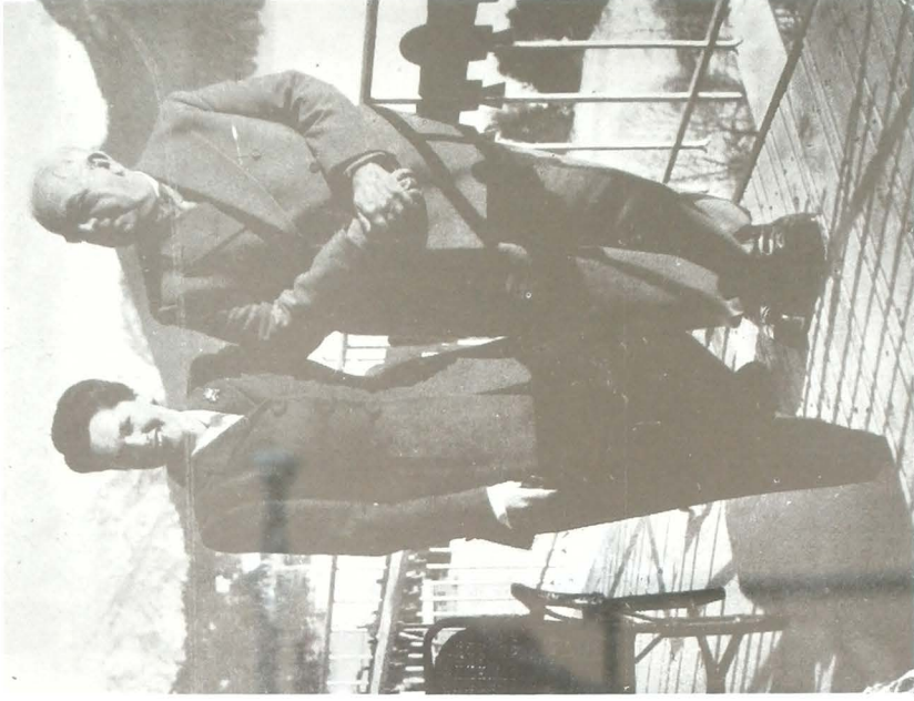
Aga Khan III with his fourth wife, Yvette Labrousse, in Zürich, 1945.