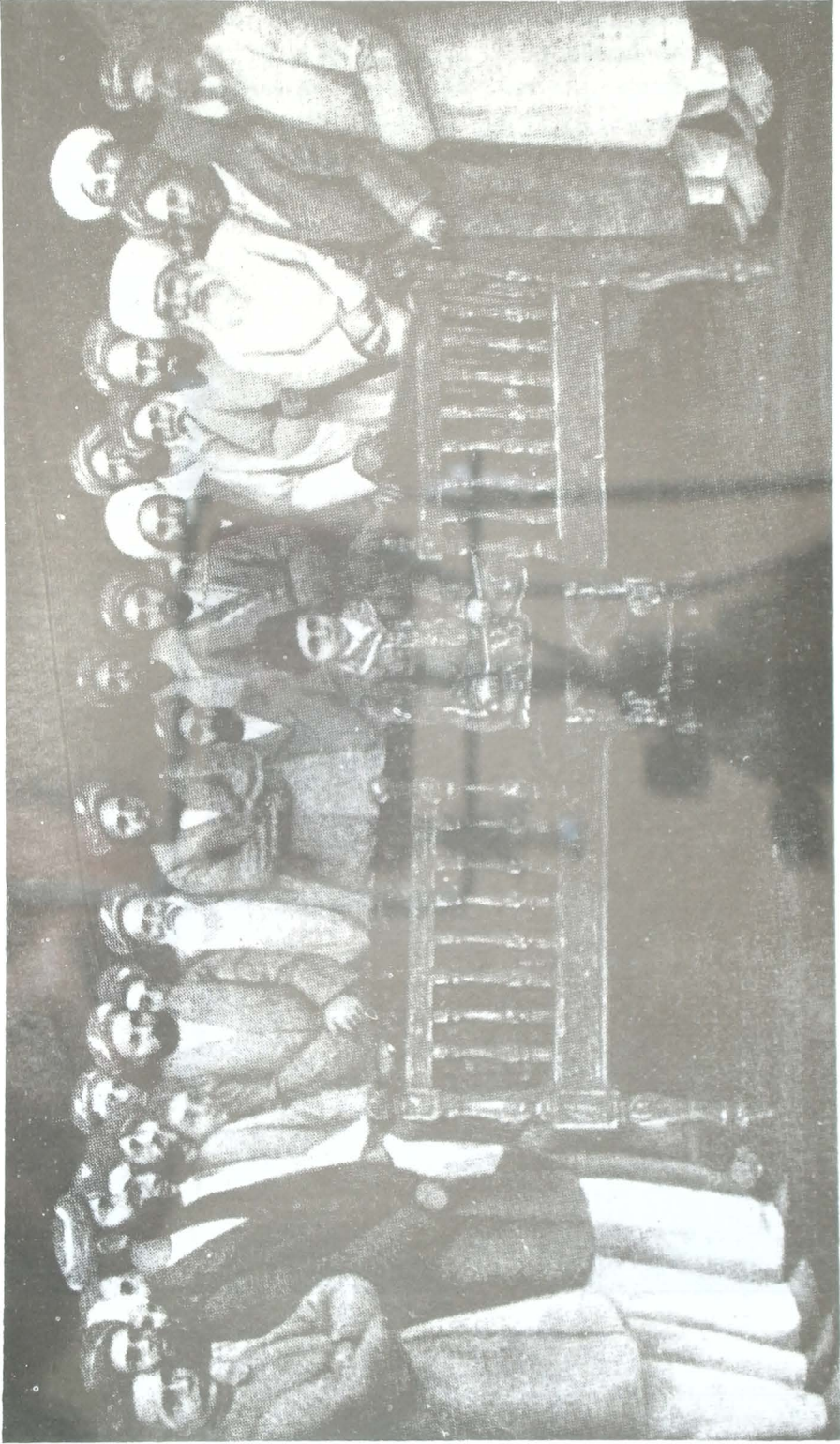
His Royal Highness, Prince Sultan Mahommed Shah, Aga Khan (centre), at the age of eight, when he was installed on the throne of the Imamate in Bombay after being proclaimed as Hazar Imam.